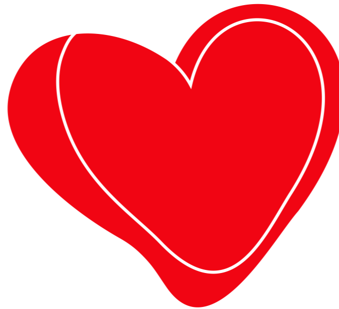
Illustration: Camila, Kollaborina

K eept me in your heart forever Ä lways choose kindness over pride R emember that love grows when we listen L et the wind carry your thoughts to places you're too afraid to reach E specially people who love K ind and optimistic, that's who we are